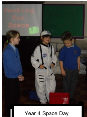
Year 4 Space Day

One thing we're really proud of at Chawson is our active approach to learning. Children get lots of opportunities to get out of the classroom or up off a chair to learn. Take a look at some of the recent ex-