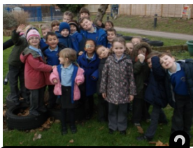
1L making bird feeders to look after the animals in winter