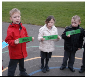
Year 2 ordering months of the year