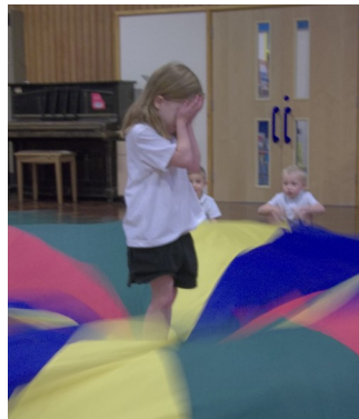
Reception children using the parachute