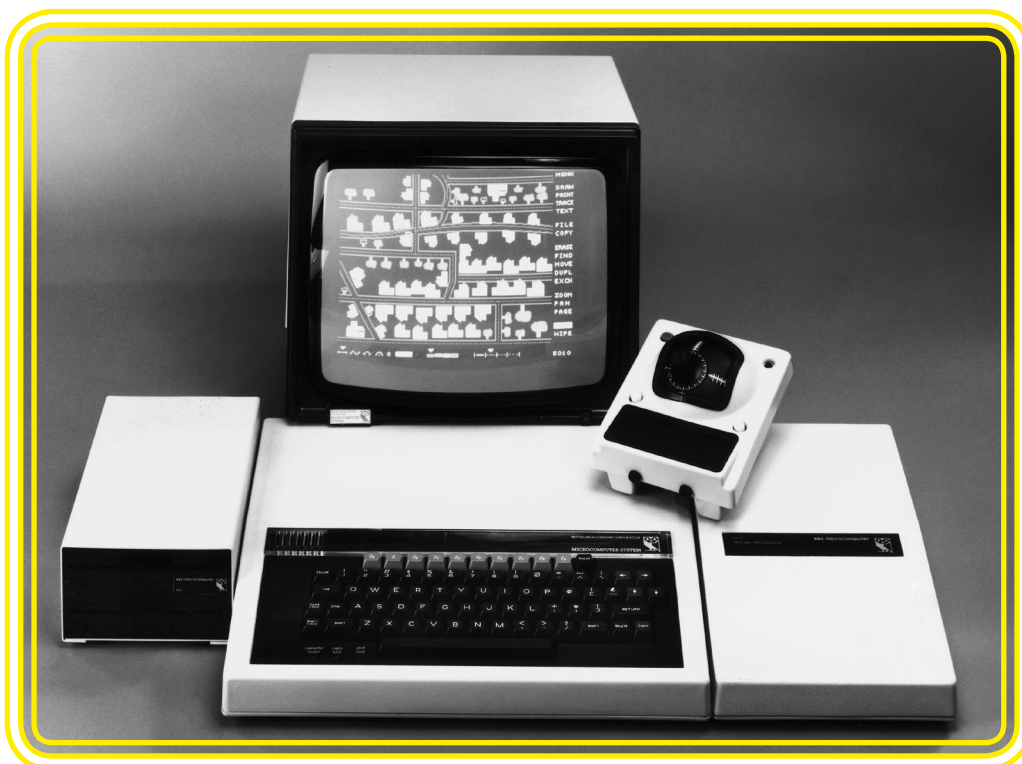
BBC Micro Computer, c. 1980s.

The ‘Next Gen’ report, commissioned by the Department of Culture, Media and Sport on the state of the UK games and visual effects industries, recommended that computer science be brought into the national curriculum as an essential discipline. Furthermore, in his speech at the Edinburgh Television Festival in 2011, Google’s executive chairman Eric Schmidt described himself as ‘flabbergasted’ that computer science wasn’t taught as standard, and that England thus risked throwing away its great ‘computing heritage’.