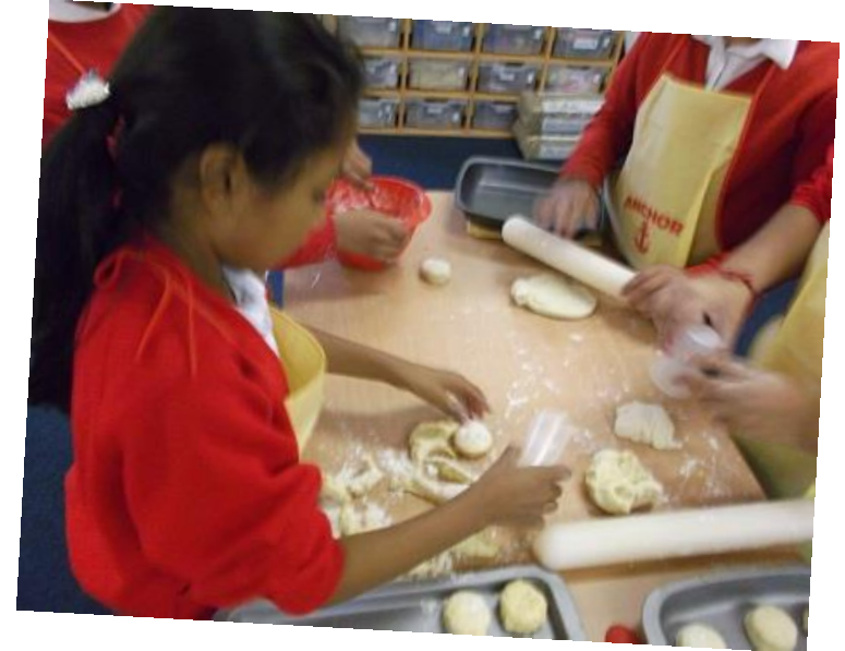
Sandfield Close Primary School, Leicester