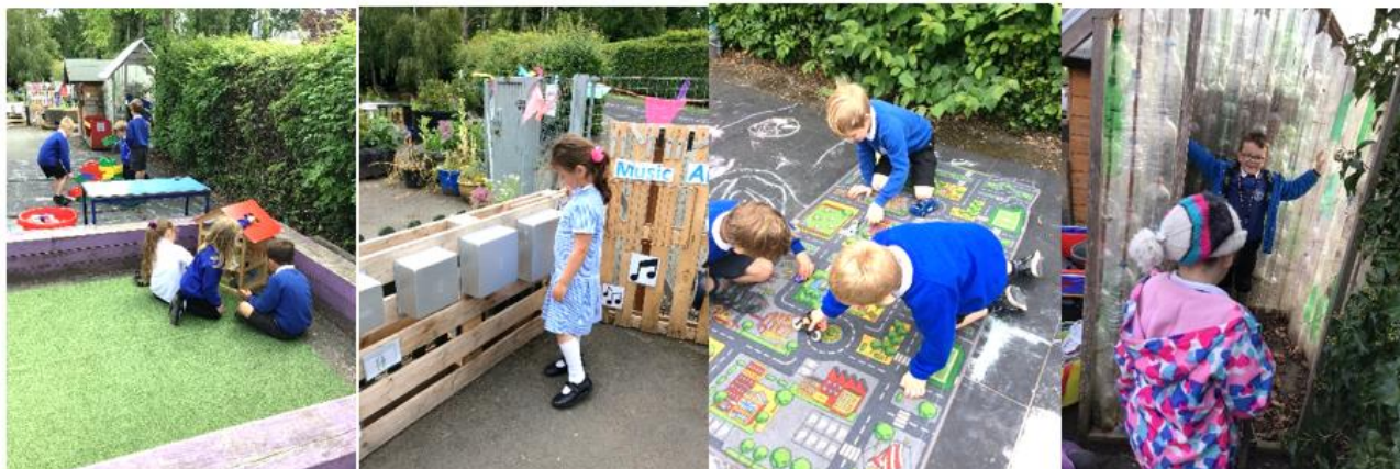
Learning in the Foundation Level outdoor classroom

Our school is divided into three classes. These are arranged to keep class sizes reasonable. Our classes are called Bedwen, Collen and Ysgawen. (These are the Welsh names for Beech, Hazel and Elder).