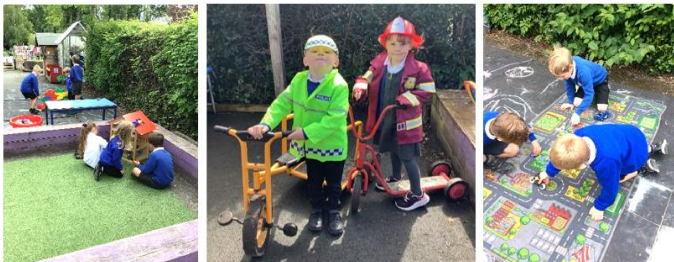
Learning in the Foundation Level outdoor classroom

Our school is divided into three classes. These are arranged to keep class sizes reasonable. Our classes are called Bedwen, Collen and Ysgawen. (These are the Welsh names for Beech, Hazel and Elder).