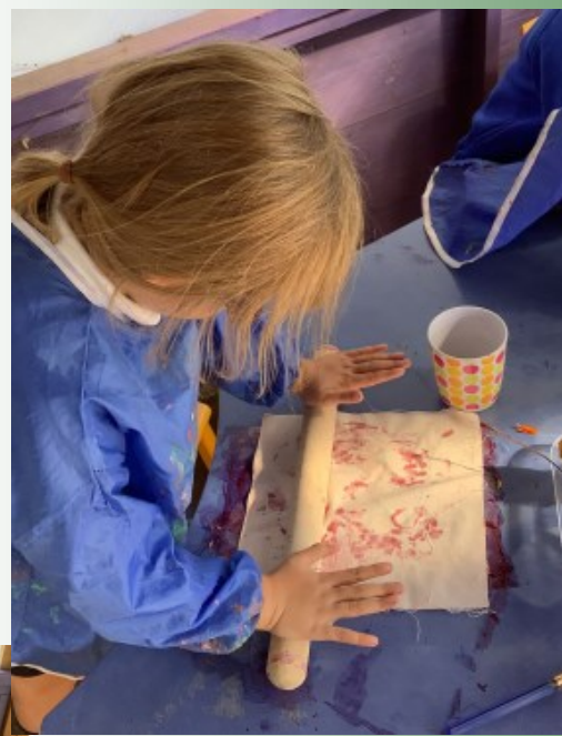
It was not easy to keep the material in one place. It kept slipping around