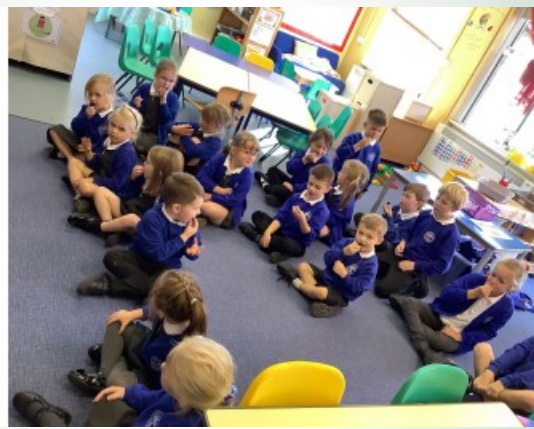
We tried the blackberries at snack time.