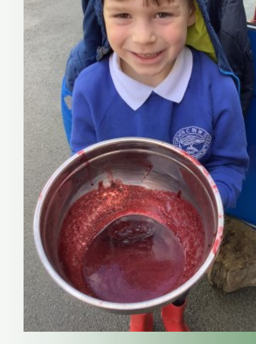
Washing blackberries was lots of fun, but very messy! It dyed our fingers red. We wondered if it would make a good dye for fabric.