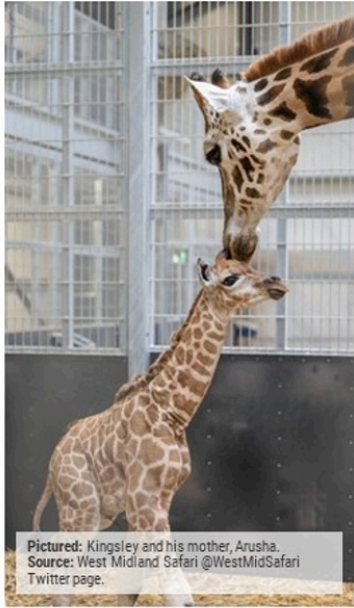
Pictured: Kingsley and his mother, Arusha.

Keepers at the West Midlands Safari Park in Worcestershire have revealed the name of their endangered baby giraffe, who was recently born into their tower. When Kingsley was born, the safari park released footage showing the 1.8m (6ft) tall Rothschild's giraffe calf making his grand entrance into the world by falling several metres to the ground. He was then tended to by his doting mother, who tried to nudge him gently to his feet. He and his parents, Arusha and Rufus, are part of a European breeding programme, which aims to conserve endangered species. The Rothschild's giraffe is one of the most endangered, with less than 1,400 adults estimated to live in the wild. The park contains the largest groups of white lions, cheetahs,