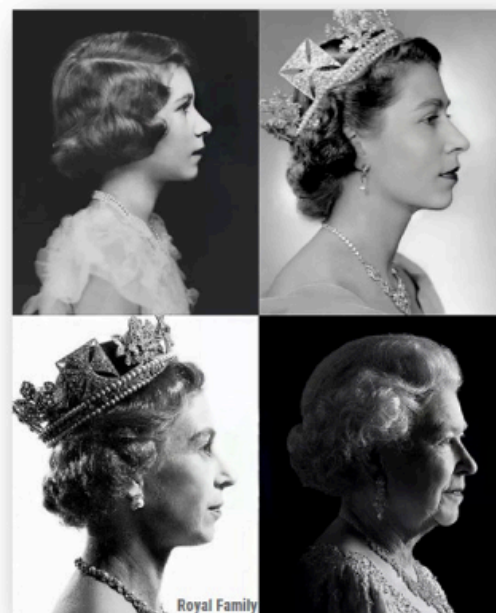
Pictured above: Four photos of Queen Elizabeth II, from childhood, to her coronation and celebrating 70 years as Queen

Queen Elizabeth II, April, 1947 on her 21 st birthday (5 years before becoming Queen).