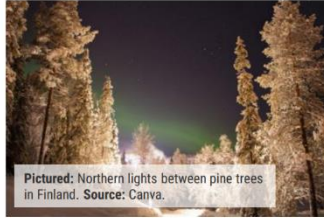
Pictured: Northern lights between pine trees in Finland.

Do you think this is a good way to work out how happy nations are?