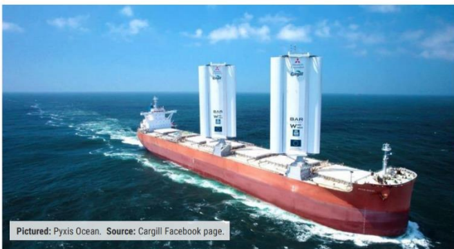
Pictured: Pyxis Ocean.

What do you think of using this technology to help reduce the shipping industry's emissions?