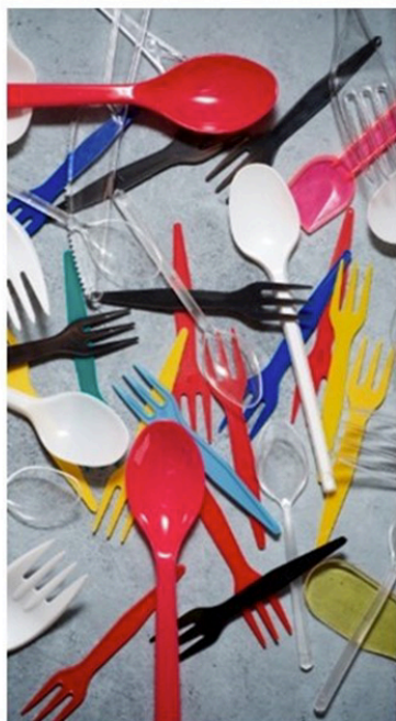
Pictured: Disposable plastic cutlery

The government has announced that single-use plastic plates, trays, bowls, cutlery, balloon sticks and certain kinds of polystyrene cups and food containers will be banned in England for environmental reasons. This follows similar announcements already made by Scotland and Wales. Research by Defra (Department for Environment, Food and Rural Affairs), tells us that each person in England uses an average of 18 single-use plastic plates and 37 items of plastic cutlery every year. Also stating that only 10% of those are recycled. 1.1 billion single-use plates and more than 4 billion pieces of plastic cutlery are used in England annually. This new rule applies to plastic packaging for food and drinks from restaurants and cafes, not supermarkets and shops (which the government will consider separately). Environment Secretary Thérèse Coffey, said, 'This new ban will have a huge impact to stop the pollution of billions of pieces of plastics and help to protect the natural environment for future generations.' Other