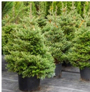
Pictured: Christmas trees in pots