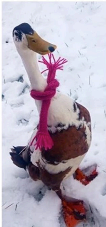
Pictured: Ham the duck