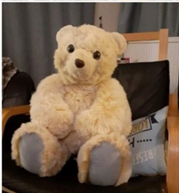
Pictured: Sinbad - before and after his restoration.