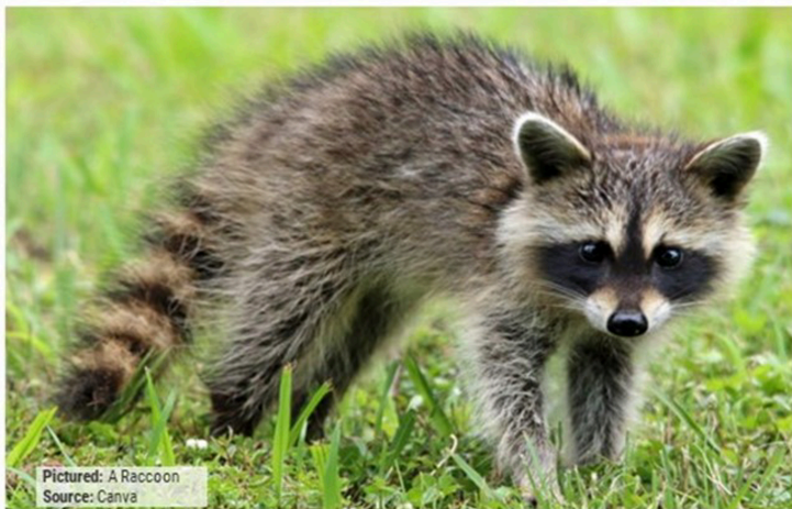
Pictured: A Raccoon

never looking back.' Leaving only a few clumps of fur behind on the tracks, the raccoon made an injury-free escape. Raccoons are known for their intelligence and problem solving. They are brilliant climbers and can descend a tree head first. They are nocturnal animals with excellent night vision, therefore they aren't normally seen in the daytime. Raccoons have the most sensitive sense of touch of any animal, their tiny 5 fingered hands are packed with over ten times the number of nerve endings as a human hand. Do you know any raccoon facts?