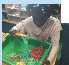
We explored Spaghetti worms from the story "The Twits"

Lower 6 pupils made a revolting recipe for Roald Dahl Day. They had great fun feeling, mixing and eating the