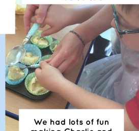
We had lots of fun making Charlie and the Chocolate Factory inspired fairy cakes